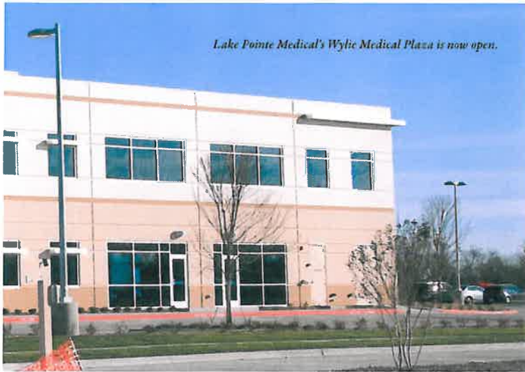
Lake Pointe Medical's Wylic Medical Plaza is now open.

and public projects. We get ½ cent sales tax revenue to use for marketing, recruitment, operations, and promotions."